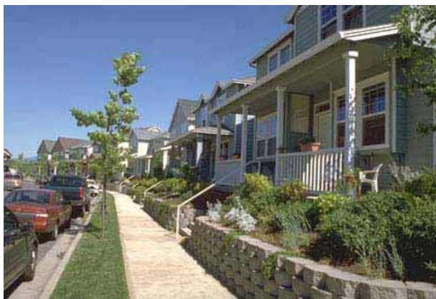
Pedestrian facilities and connections will be a key feature of moderate density neighborhoods.

Public water and wastewater will be required for development in this area and residential densities are anticipated to be approximately three to four dwelling units per acre for single-unit detached housing. Higher density development of up to six detached units per acre, or up to ten units per acre may be considered where transferable development credits are obtained to support the density. Growth within this district should occur only in increments beginning in areas already served or adjacent to areas served with utilities in or near the City of Hastings and extending outward based on the contiguity criteria noted previously.