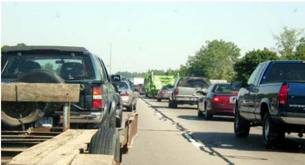
The unfortunate result of uncoordinated planning is often monotonous suburban residential development, strip commercial patterns on the roads, and ever-increasing traffic.

This fragmentation of local and regional decision-making – either by geography or by areas of technical responsibility – can frustrate attempts to coordinate efforts for the protection and enhancement of quality of life in an area. In fact, as the population grows and the effects of that growth create varied demands on this fragmented governance structure, the response of one agency to a challenge could, and often does, work at cross-purposes to the policies of another.