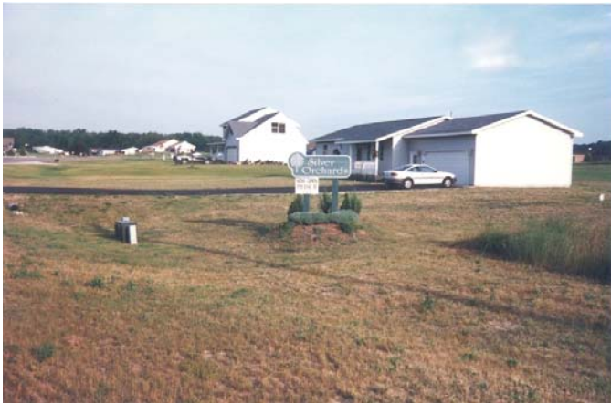
About 3,000 to 4,000 acres of rural land could be consumed by low density suburban sprawl

neighborhoods. At an average of one to two acres per household and assuming the current household size of about 2.6 persons per household, the community will see 3,000 to 4,000 acres of the rural landscape consumed, largely by suburban sprawl patterns of development. Certainly, the areas offering the greatest attraction for development are those with the most desirable natural features. Thus, accommodating new development with old approaches will likely result in a significant loss or degradation of the region's unique rural, small town character.