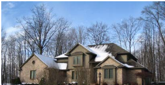
The primary land use will be single-unit homes oriented to compliment natural areas.

Low Density Residential. The Low Density designation anticipates high quality and aesthetic forms of development at a density of about one unit per acre, 2 creating a very attractive living environment for residents. The primary land use within this area will be detached single-family homes. Conservation design techniques will be encouraged, where